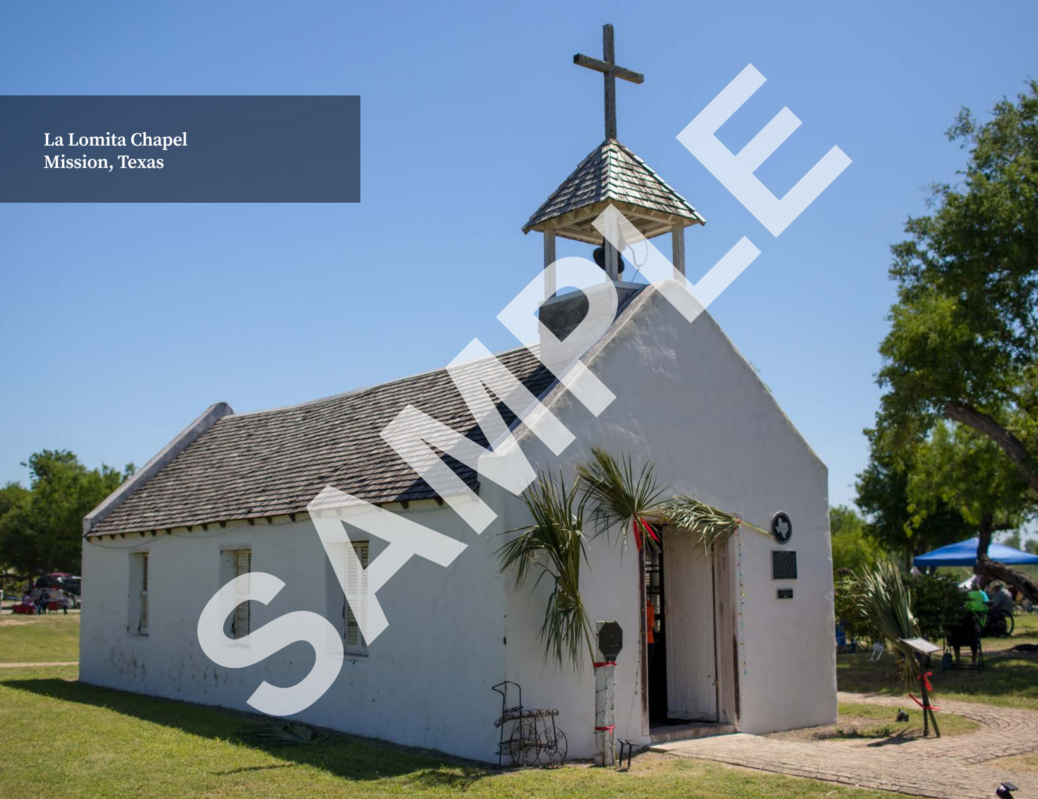
La Lomita Chapel Mission, Texas