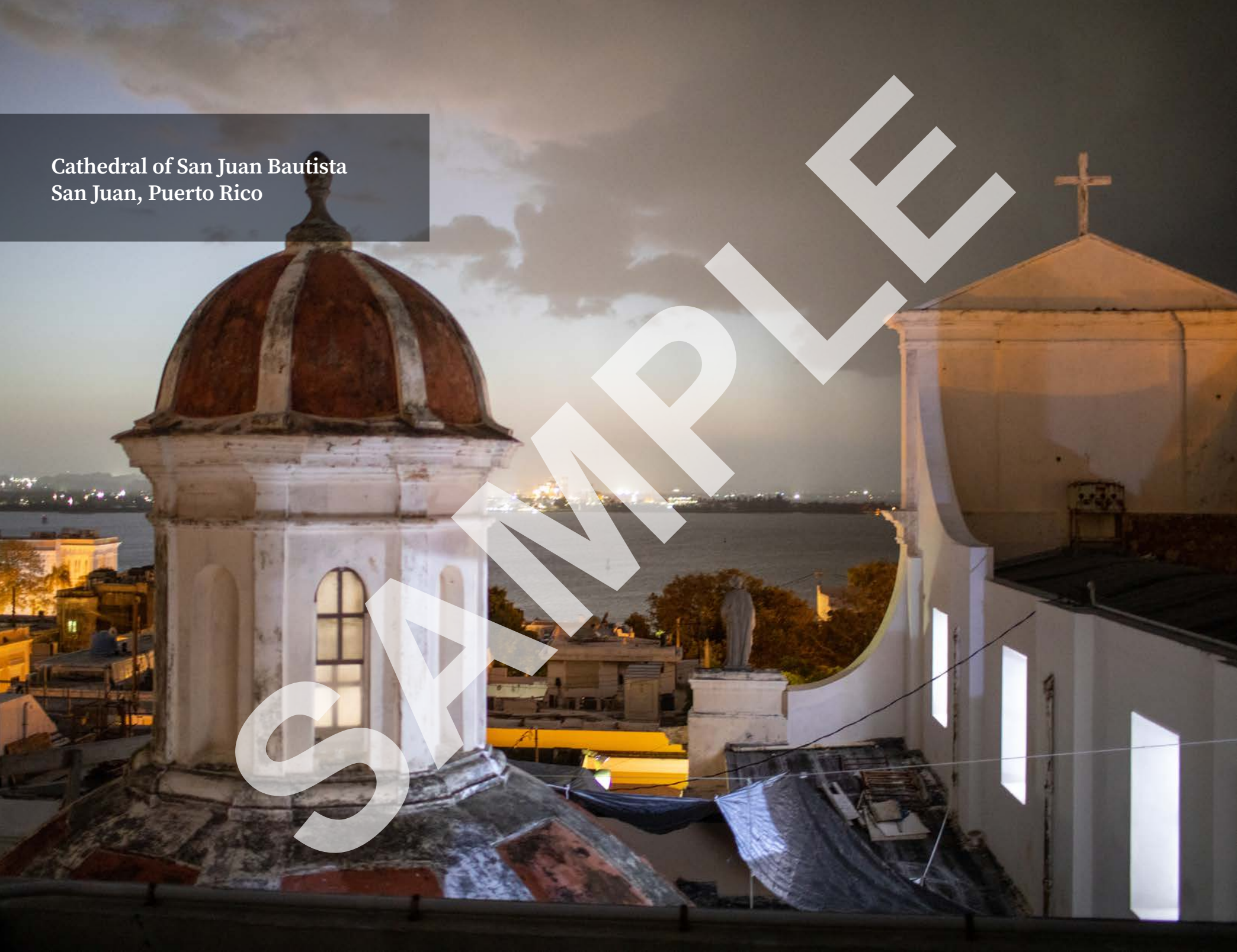
Cathedral of San Juan Bautista San Juan, Puerto Rico