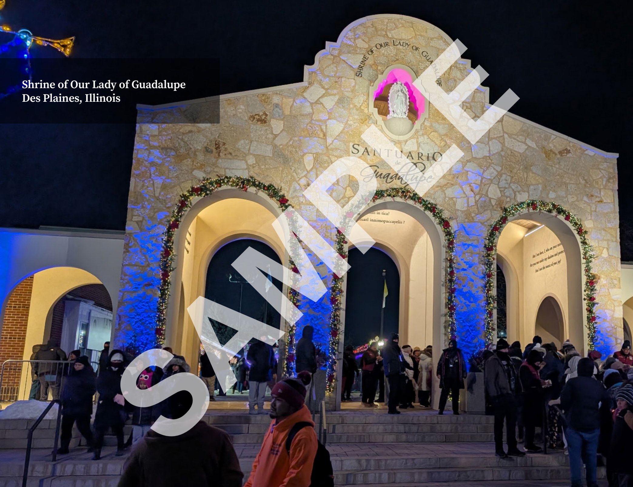
Shrine of Our Lady of Guadalupe Des Plaines, Illinois