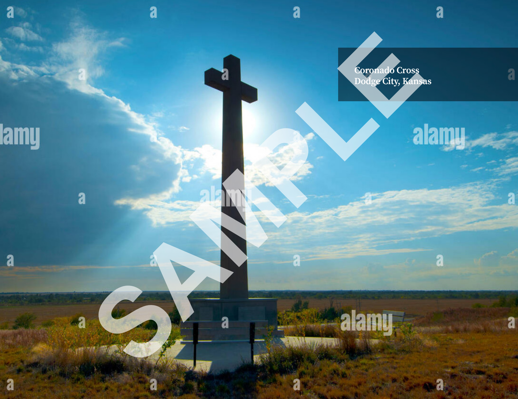
Coronado Cross Dodge City, Kansas